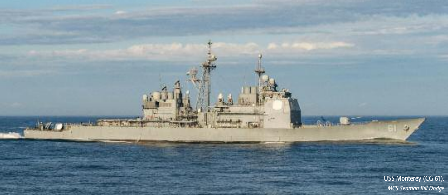
USS Monterey (CG 61). MCS Seaman Bill Dodge