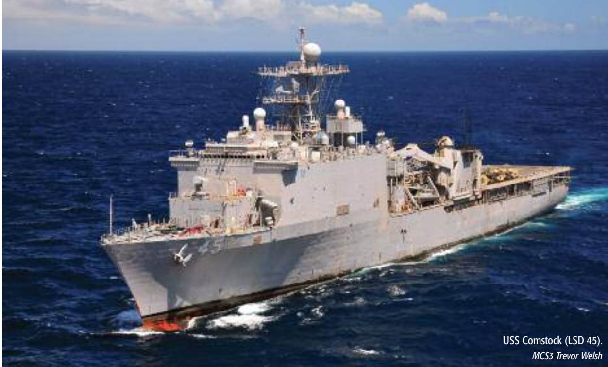
USS Comstock (LSD 45). MCS3 Trevor Welsh

All of these efforts to optimize energy use enable the Navy to improve readiness and ensure a more capable and lethal fighting force.