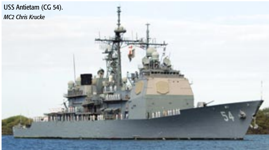
USS Antietam (CG 54).