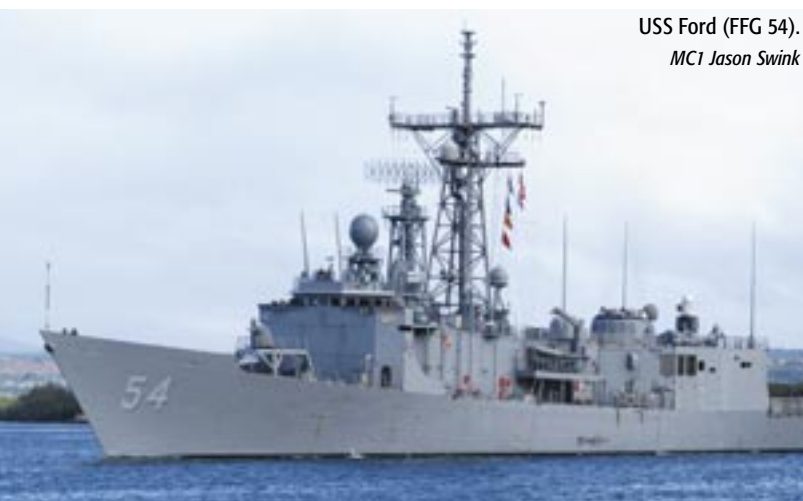
USS Ford (FFG 54).